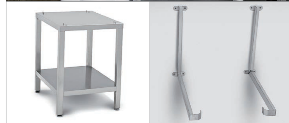
Support stands suitable for every unit.