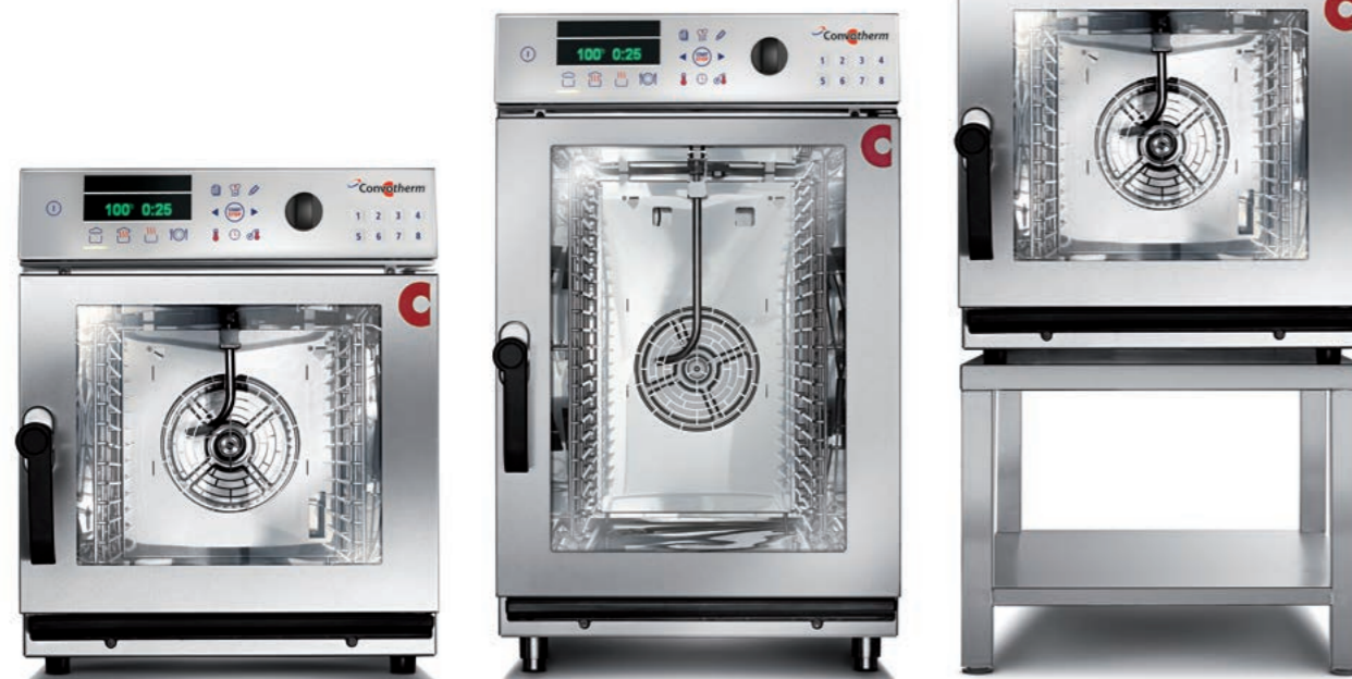
6.06 mini (6 x 2/3 GN) – also mobile 6.10 mini (6 x 1/1 GN) – also mobile

There are combi steam ovens in four different sizes available in our mini series: