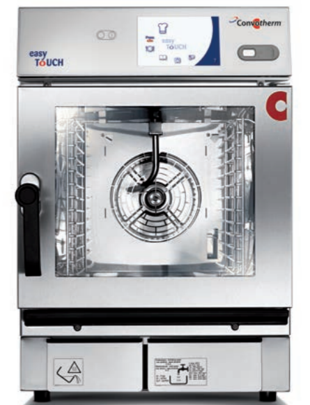
6.06 mini mobile 6 x 2/3 GN 6.10 mini mobile 6 x 1/1 GN