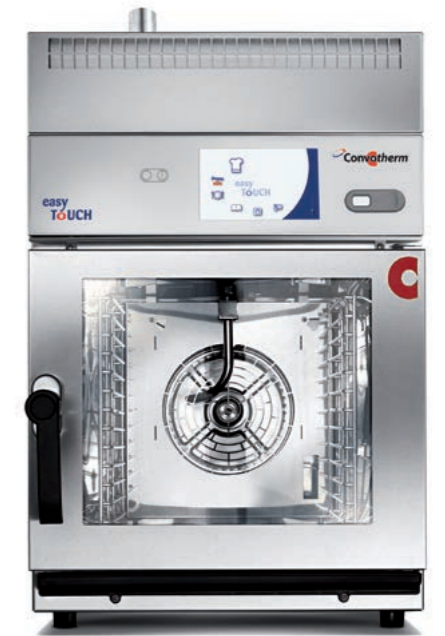
ConvoVent mini condensation hood; ideal for front cooking.