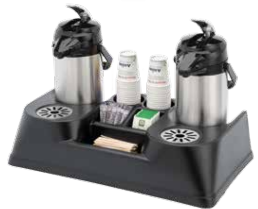
Thermos jug buffet

Stylish and practical presentation of hot drinks for serving table arrangements. Suitable for both types of the thermos jugs with pump.