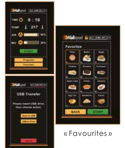
« Favourites »